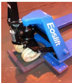
Pallet Truck Check